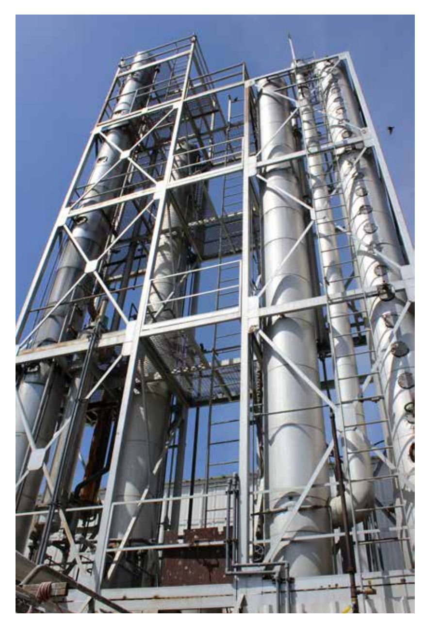
The scale of operations at DRinc has helped the company win awards from the likes of Beverage Testing Institute, the San Francisco Spirits Competition and the Micro Spirits Award.

"We can go from potato to bottle in six days and produce over 750,000 gallons of alcohol in a year ... We consumed and processed over nine million pounds of whole Idaho-grown russet potatoes in the last 12 months."